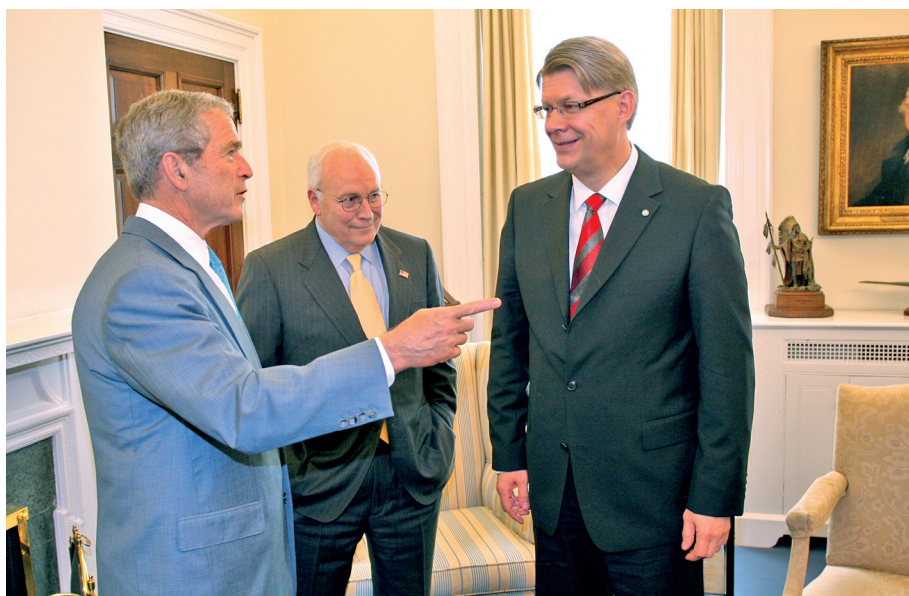
Latvian President Valdis Zatlers meets with US President George W. Bush and Vice-President Dick Cheney in the Oval Office. 24 April 2008.