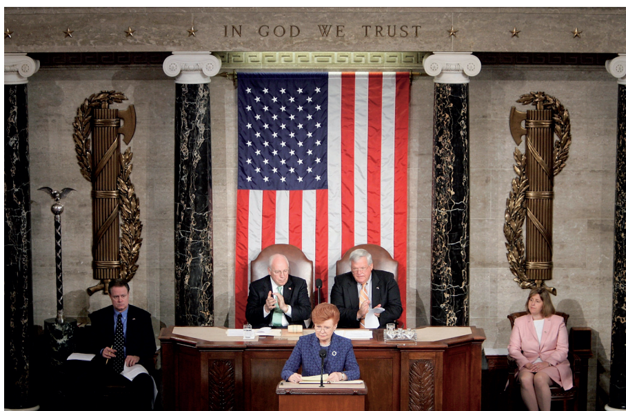
Latvian President Vaira Vīķe-Freiberga addressing a joint session of the US Congress on 7 June 2006.